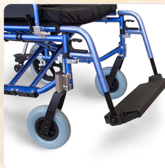
Individual footplates w/removable footboard