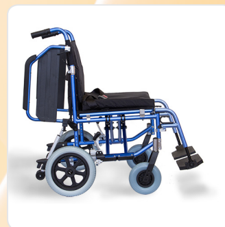
Flip back armrests