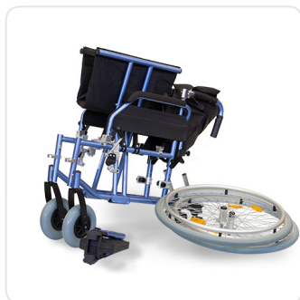
Dismantle for transport