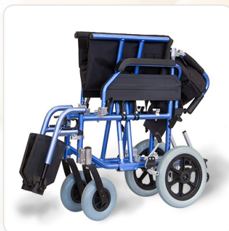
Easy fold away